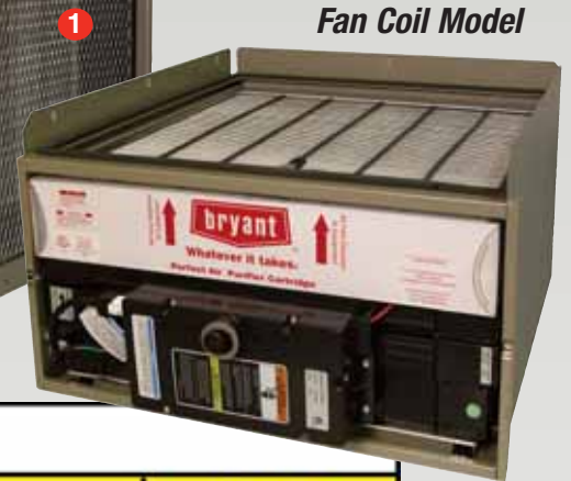
Fan Coil Model