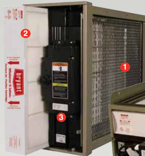
Gas Furnace Model

Exclusive, state-of-the-art technology kills captured viruses, bacteria, mold spores and other allergens.